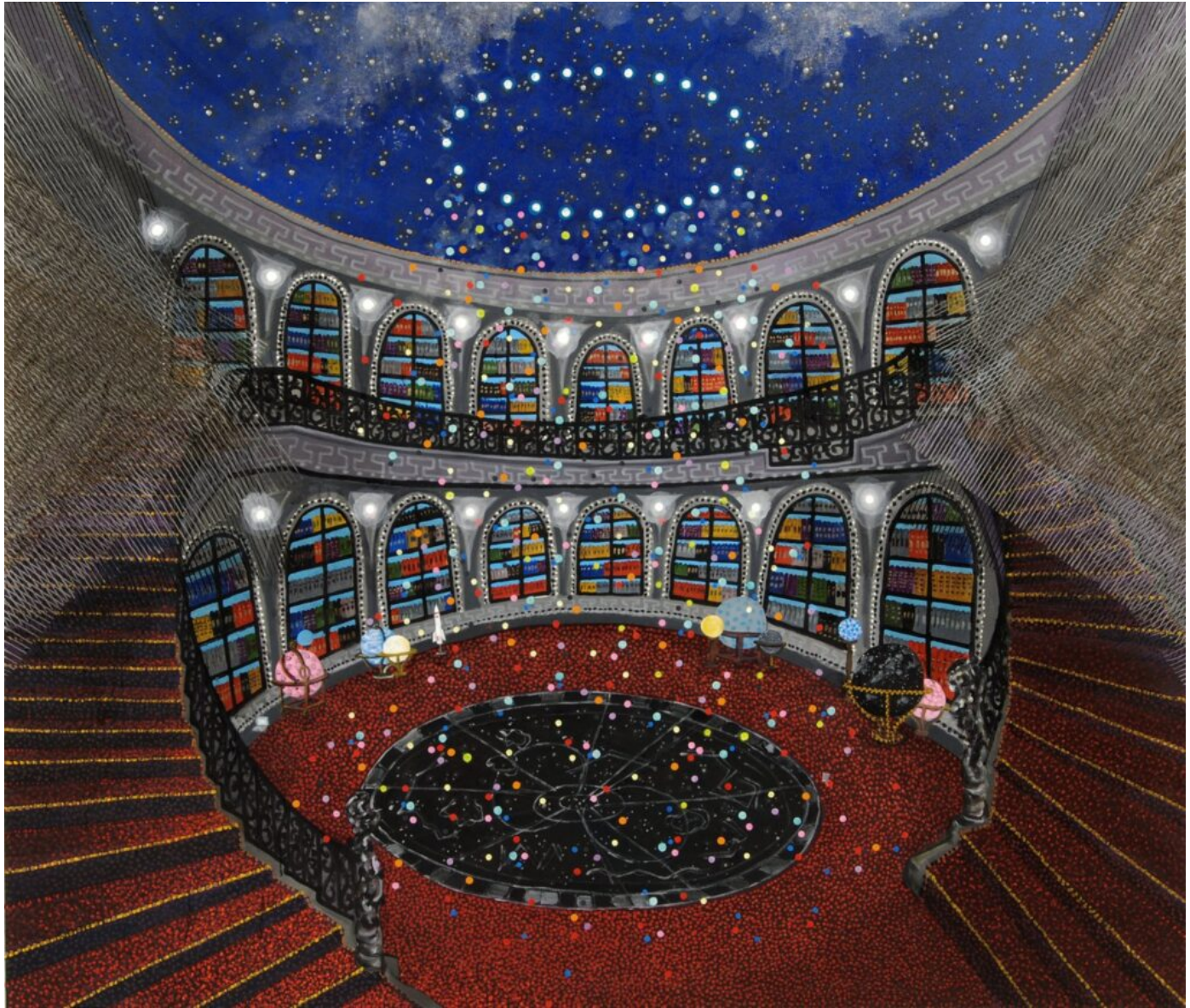
Michiko Itatani, 'Cosmic Wanderlust (Hyperbaroque 13-C-1 (CWH-2)),' 2013.

Only upon further examination does the metaphysical dimension of each interior reveal itself through a wealth of whimsical detail. Archways open directly onto deep space, portholes filled with stars appear in the floors and ceilings, luminous motes of stardust float everywhere, giving every painting an eerie glow.